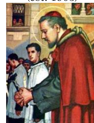
November 4 Patron of Seminarians and Catechists

Oh God, Maintain in your people that spirit with which you inspired your Bishop St. Charles, so that your church may be constantly renewed, conforming itself to Christ and manifesting Christ to the world.